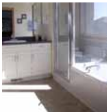
KITCHEN AND BATHROOM